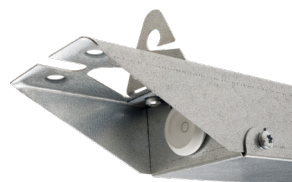
Integrated fold-up bracket for suspending on a wire.