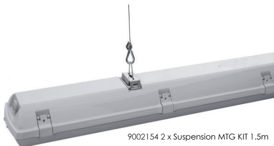
9002154 2 x Suspension MTG KIT 1.5m