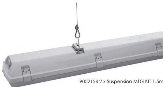
9002154 2 x Suspension MTG KIT 1.5m